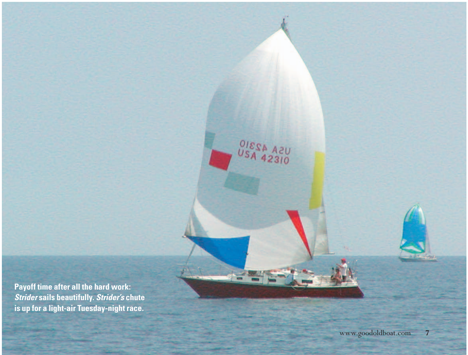
Payoff time after all the hard work: Strider sails beautifully. Strider's chute is up for a light-air Tuesday-night race.

Builder: Scorpio Yachts Located: London, Ontario Year: 1981 LOA: 35 feet 0 inches LWL: 26 feet 6 inches Draft: Was 5 feet 10 inches; Mars Metal bulb kit shortened to 5 feet 4 inches Beam: 11 feet 2 inches Engine: Yanmar 2GM (15-hp) Tankage: 15 gallons fuel, 30 gallons water, 30 gallons holding tank Construction: Balsa-cored fiberglass deck and hull